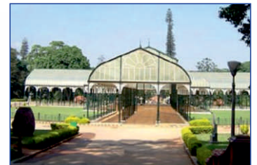
Lalbagh Botanical Garden