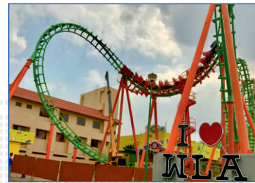
Wonderla Theme Park