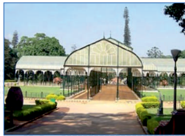
Lalbagh Botanical Garden